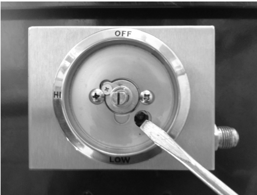
“LOW” Flame setting adjustment screw.

(It will be easier to adjust flame size with grill and heat deflector removed)